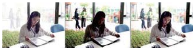
Over-exposure to diminish background